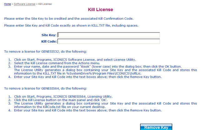
Figure 4 - Site Key/Kill Code Dialog