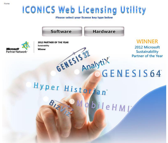
Figure 2 – ICONICS Web Licensing Utility

NOTE: If you do not have a user name and password pair you can register for one using the “Create New Account” link at the bottom. If you have a username and password but have forgotten them, you can click on the “Forgot Password” link at the bottom.