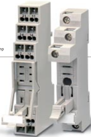
P2RF-E Screw Terminal Socket